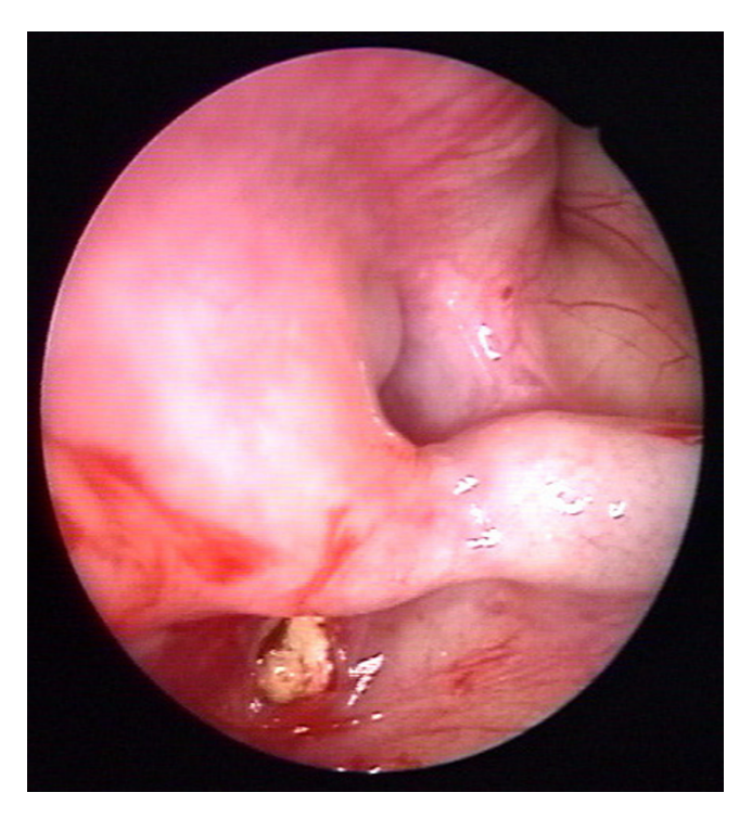
Figure 3 Intraoperative endoscopic view of the foreign body in the supero medial aspect of the maxillary sinus.