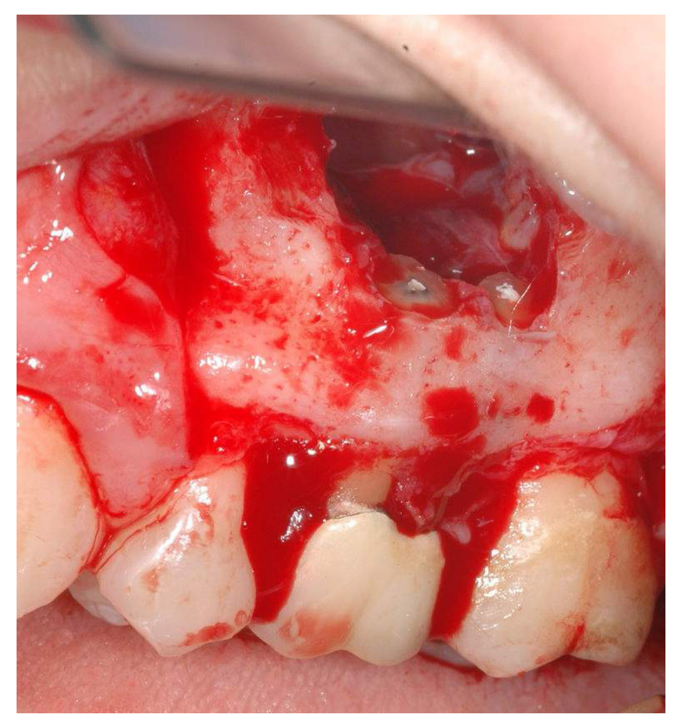
Figure 5 Intraoperative view of contemporary endodontic surgical treatment of the upper first left molar roots.