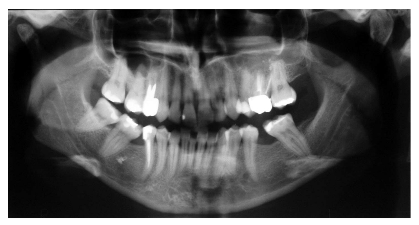
Figure 1 Orthopantomography showing radiopacity of the left maxillary sinus.