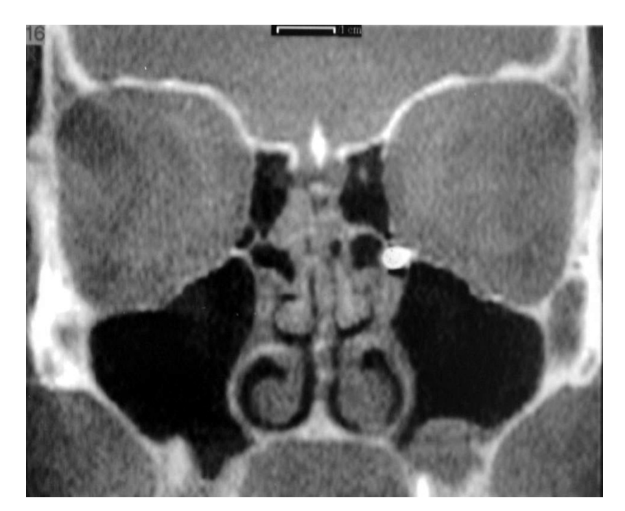
Figure 2 Computed tomography scan (coronal plane) showing the foreign body located in the supero medial aspect of the maxillary sinus and partial mucosal thickening of the sinus upon the roots of the upper first molar.