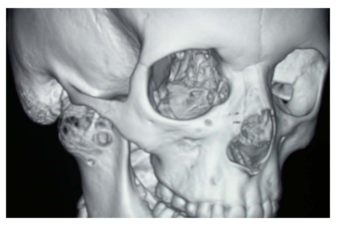
Figure 4 Three-dimensional CT reconstruction showing the presence of a radiolucent and multilocular lesion in the condyle region, the coronoid and part of the ramus. Note the honeycomb appearance and septae within the bony lesion.

Patient's occlusion did not change after surgery however it was evident that the mandible shifted on the right side during opening [Figure 9]. The patient underwent throw physiotherapy and functional treatments with Bionator. This device helped the boy to have a good occlusion during his growth. The patient came monthly to our orthodontic department for functional exercises and to upgrade the Bionator.