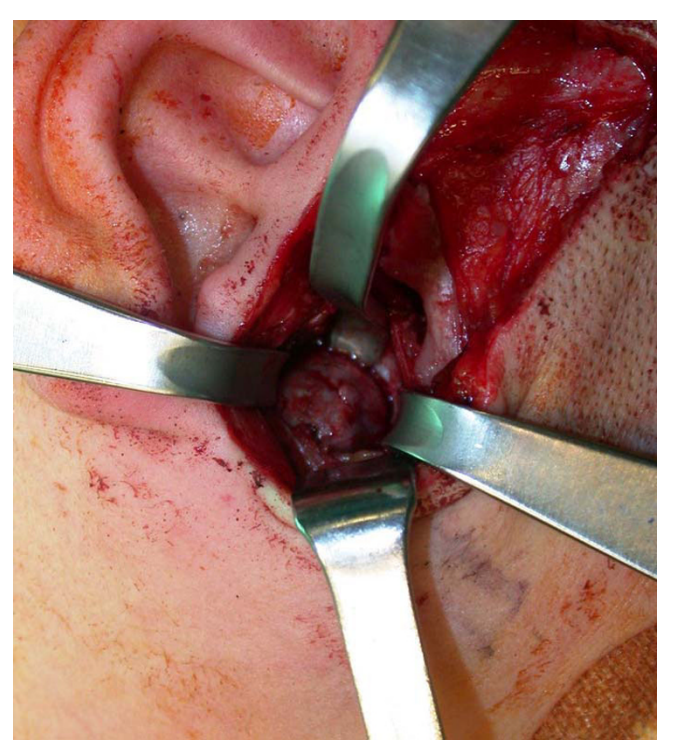
Figure 7 Intraoperative exposure of the thin, translucent lateral cortical plate overlying the mandibular cyst. Afterwards a low condylectomy, a coronoid process and mandibular ramus curettage were performed.

It is important to differentiate the ABC from other pathologies that occur in the maxillofacial region. These include peripheral and central giant cell reparative granuloma, traumatic bone cyst, brown tumor of hyperparathyroidism, myxoma, fibrous dysplasia, desmoplastic fibroma, fibrous histiocytoma, hemangioma, osteogenic