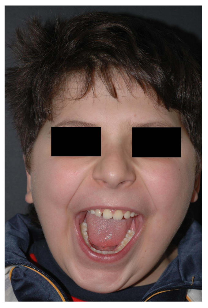
Figure 9 Post-operative image showing the shifting of the mandible during opening towards the operated side.

The treatment of this lesion consist of complete surgical excision, it demonstrates a low recurrence rate. It has been proposed radiation therapy however the risk of subsequent malignant degeneration is present. It has been reported sarcoma arisen within radiated ABC [[1,3] and [4]]. Even curettage of the cysts has a recurrence rate as high as 50%. Technical difficulties in entirely removing very large lesions can be the explanation for very different