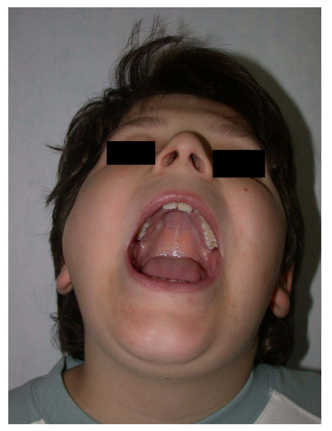
Figure I Pre-operative image showing the severe swelling which depicted soft tissue invasion of the vascular Aneurismal Bone Cyst. The patient was able to open widely.

A posterior-anterior radiography of the skull was obtained revealing a radiolucent region in the condyle of the right mandible [Figure 2]. A three-dimensional CT reconstruction showed the presence of a radiolucent and multilocular lesion in the condyle region. It was possible to