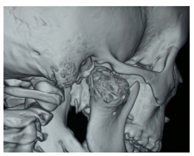
Figure 3 Three-dimensional CT reconstruction showing the presence of a radiolucent and multilocular lesion in the condyle region, the coronoid and part of the ramus. Note the honeycomb appearance and septae within the bony lesion.

Upon removal of the outer cortex of bone, thick greenish fluid was encountered, immediately followed by brisk hemorrhage which was difficult to control. Afterwards a low condylectomy was performed. The lesion underwent a complete surgical excision [Figures 7, 8]. The final histological diagnosis was aneurysmal bone cyst described as an expanding osteolytic lesion containing blood-filled spaces of variable size, separated by connective tissue constituted by bone trabeculae or osteoid tissue and many osteoclastic giant cells.