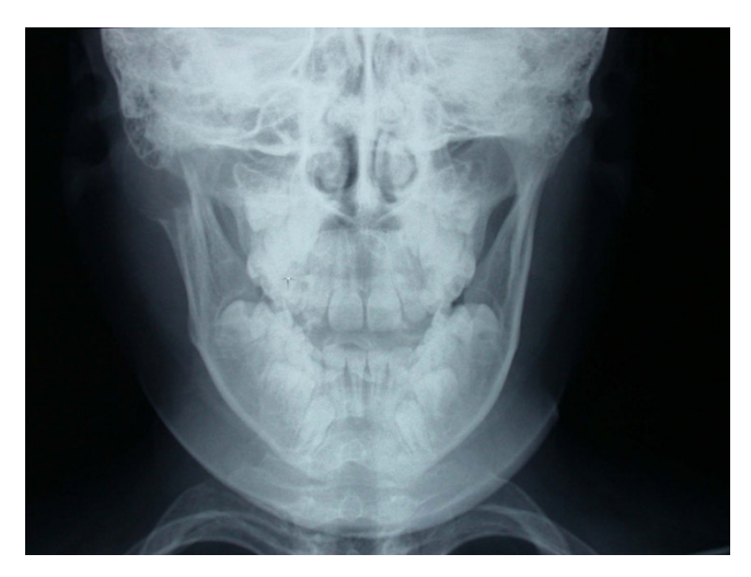
Figure 2 Posterior-anterior radiography of the skull. Radiolucent lesion of the right condyle.

Upon removal of the outer cortex of bone, thick greenish fluid was encountered, immediately followed by brisk hemorrhage which was difficult to control. Afterwards a low condylectomy was performed. The lesion underwent a complete surgical excision [Figures 7, 8]. The final histological diagnosis was aneurysmal bone cyst described as an expanding osteolytic lesion containing blood-filled spaces of variable size, separated by connective tissue constituted by bone trabeculae or osteoid tissue and many osteoclastic giant cells.