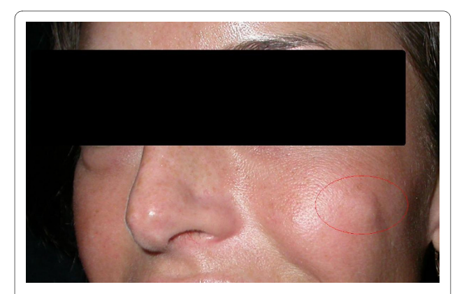
Figure 1 Preoperative appearance of the neoplastic nodule.

ondary to injection of hyaluronic acid skin fillers is believed to be low, and the vast majority of them represent a foreign body-related chronic inflammatory reaction.