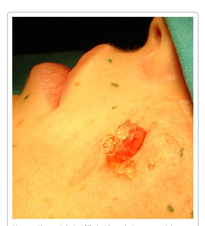
Figure 2 The cystic lesion filled with a gelatinous material was removed.

The cyst in the zygomatic region is the element of a seemingly obvious relationship: its formation was attrib-