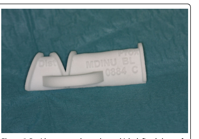
Figure 3 Rapid prototyped template, which defined the graft length and angle of junction.

patients, providing them with a better understanding of the process and its possible outcomes.