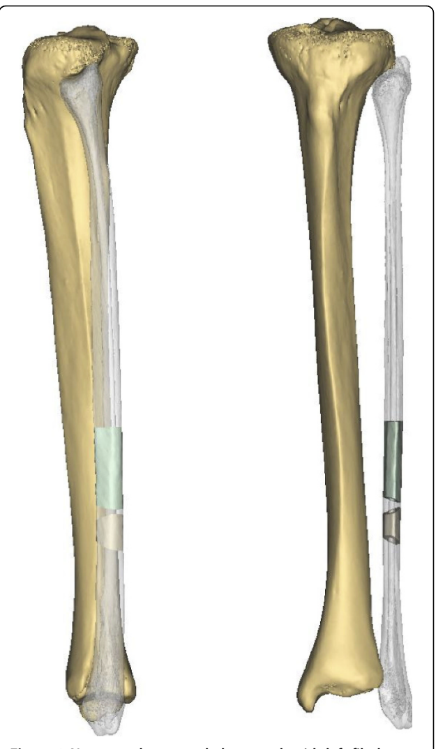
Figure 2 Necessary bone needed to match with left fibula.

Two groups have recently demonstrated the efficacy of virtual planning and use of a rapid prototyped template to reconstruct the mandible with a fibula graft. These researchers presented favorable results concerning precision and outcome [3,4]. Compared to the mandible, the