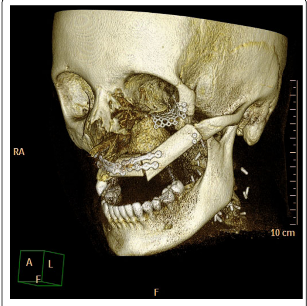
Figure 5 Postoperativ CT 3D reconstruction.

techniques and to benefit from the advantages of preoperative planning.