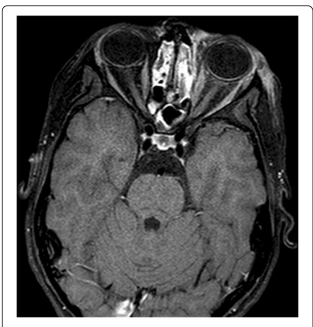
Figure 2 Axial contrast-enhanced fat suppressed T1-weighted MR. The image demonstrates ethmoid and sphenoid sinusitis and an heterogeneous enhancement of left eyelid tissues and of orbital fat. The left orbital extraocular muscles show a moderate enhancement due to edema and hyperaemia. Left medial rectus muscle is also moderately thickened.

In the second day after surgery the patient had no fever (36.5°C) and the pharingodinia decreased. Histology of the mucosal samples showed connective tissue characterized by diffuse and conspicuous acute and chronic inflammatory infiltrate. Culture of the orbital and ethmoidal essudates showed numerous colonies of group-A Streptococcus pyogenes which was sensitive to penicillin and cephalosporin derivates, to macrolides, tetracycline, chinupristine/ dalfopristine, vancomycine and clindamycin. An intermediate sensibility was observed for levofloxacine. At