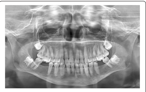
Fig. 3 A panorex image of the jaws showing generalized microdontia

A panoramic view (64 kV, 112 mAs) confirmed missing teeth 36 and 46, and revealed caries on teeth 15, 25 and 21. There was generalized spacing of mandibular dentition and an overerupted first maxillary right molar (Fig. 3). The radiologist also noted generalized osteopenia of the mandible. Further investigations were undertaken to confirm the presence of osseous changes and to establish the magnitude of possible osteopenia\osteoporosis. According the WHO, osteopenia is defined as "bone density measurements (T score) between 1 and 2.5 standard deviations below the young adult mean" [10]. To avoid exposing the young patient to further radiation exposure and as the panorex radiograph was already available, the bone mineral density (BMD) was determined by digitalizing and analyzing the dental images. The BMD of the mandible correlates favourably with that found in the lumbar spine and neck of the femur which are the conventional sites of BMD measurements [11, 12]. Both linear and densitometric measurements