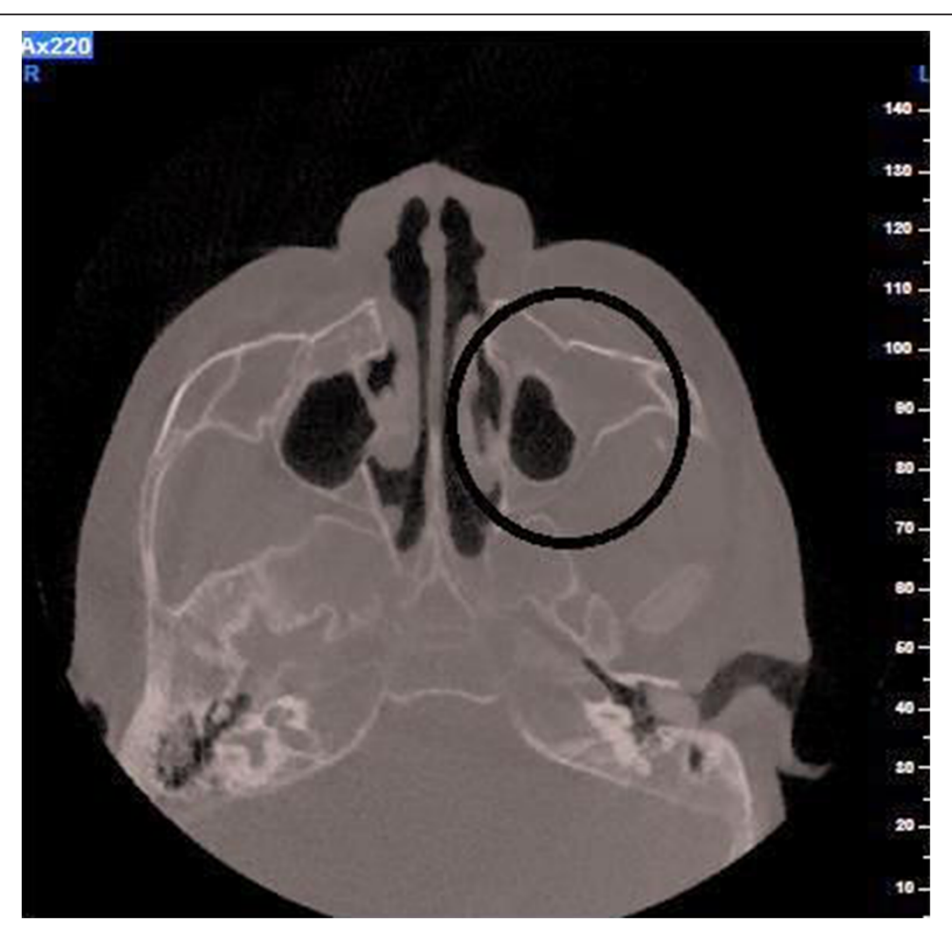
Fig. 4 Cone Beam Tomography showing hypoplasia of both maxillary sinuses

The CANDLE syndrome is caused by homozygosity for mutations in the Proteasome (Prosome, Macropain) Subunit, Beta Type, 8 ( PSMB8 ) gene that encodes for proteasomes that are responsible for the physiological degradation of proteins. Mutations of PSMB8 result in an accumulation of modified and oxidated proteins in cells and tissues, leading to an increase of cellular stress and increased apotosis occurring in muscle and fat [1, 15–17]. Recent developments indicate that not all