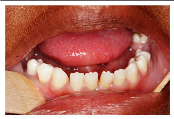
Fig. 2 Generalized microdontia, spacing of teeth and mammelons affecting the permanent dentition

Numerous investigations for autoimmune and infectious diseases had been undertaken. These included Anti-Nuclear antibodies ANA (3 consecutive tests), anti-DNA antibodies and other auto-antibodies. She had a normal white blood cell count, mild microcytic anemia, and mild elevation of platelet levels. These investigations all yielded negative results. Inflammatory markers and serum triglycerides were elevated. At times of flare, transient